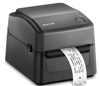
WS4 Series Printer

SATO AMERICA CORPORATE 14125 South Bridge Circle Charlotte, NC 28273 Phone: (704) 644-1650 sales-sa@sato-global.com